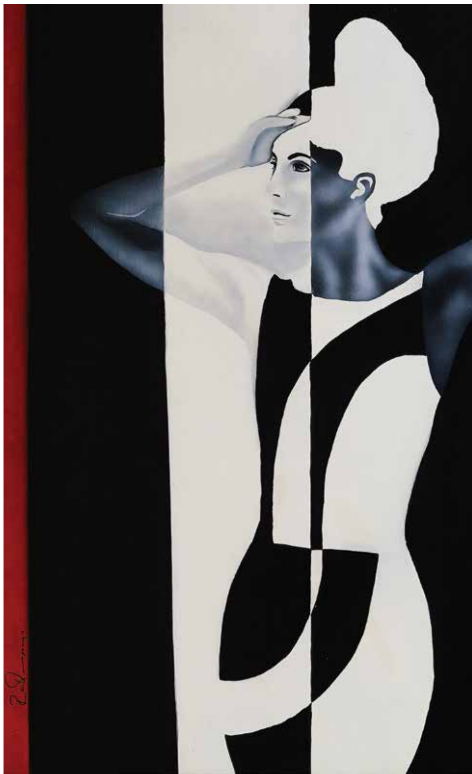
Fedora Acrylic on canvas 36 x 60 inches