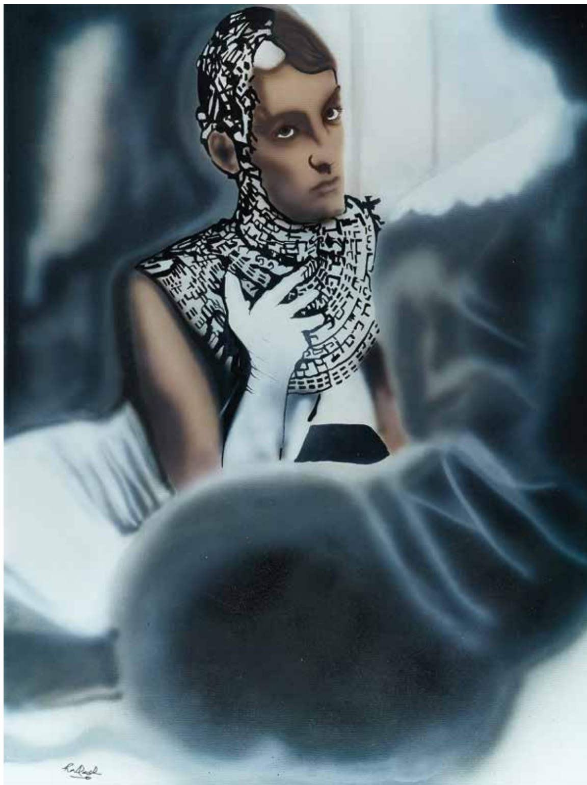
The Acrylic Mirror Acrylic on canvas 36 x 48 inches

Those eyes are not mine, they belong to the truth in the frozen moments