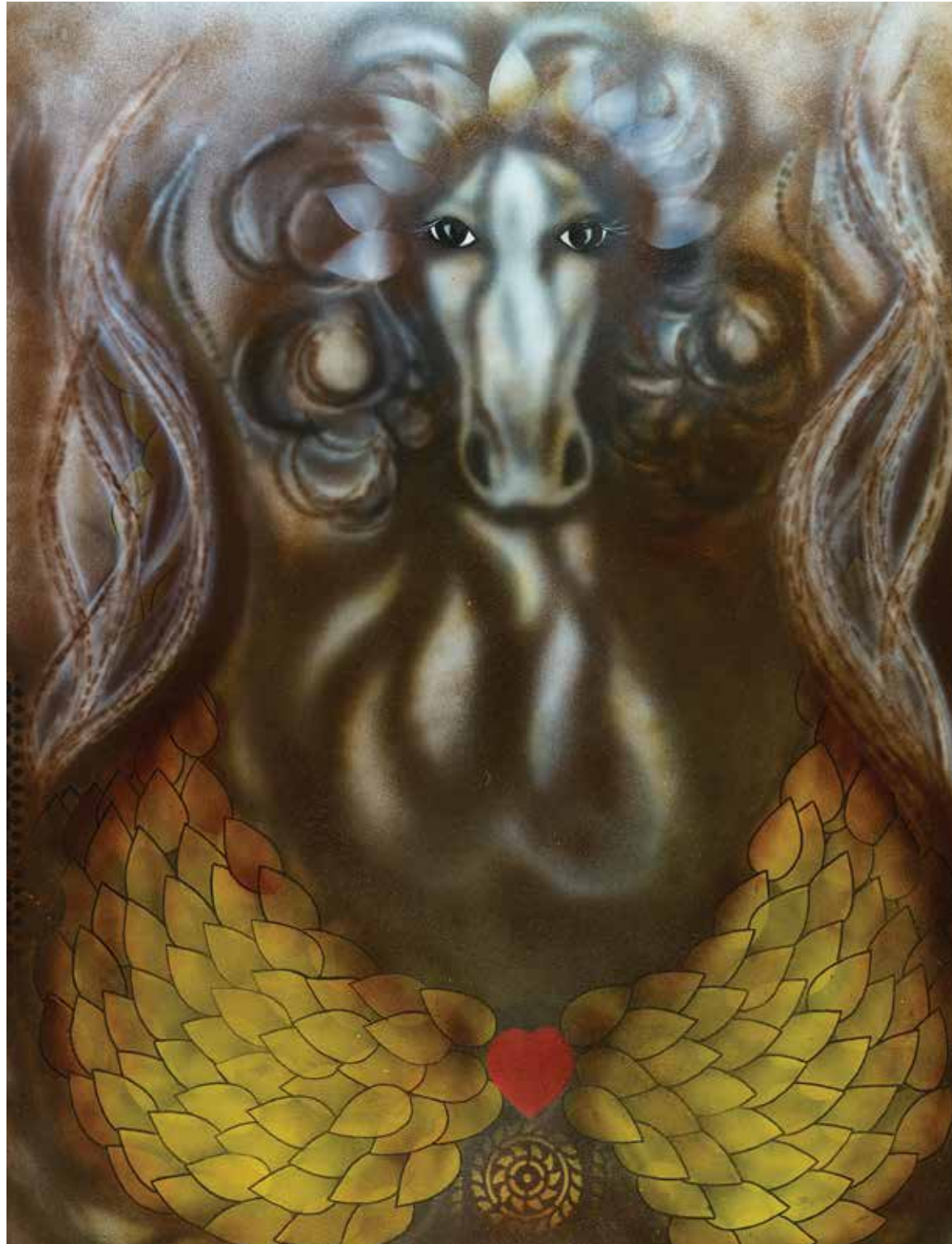
Dreamer Acrylic on canvas 48 x 60 inches

When you stare into the abyss, the abyss stares back at you