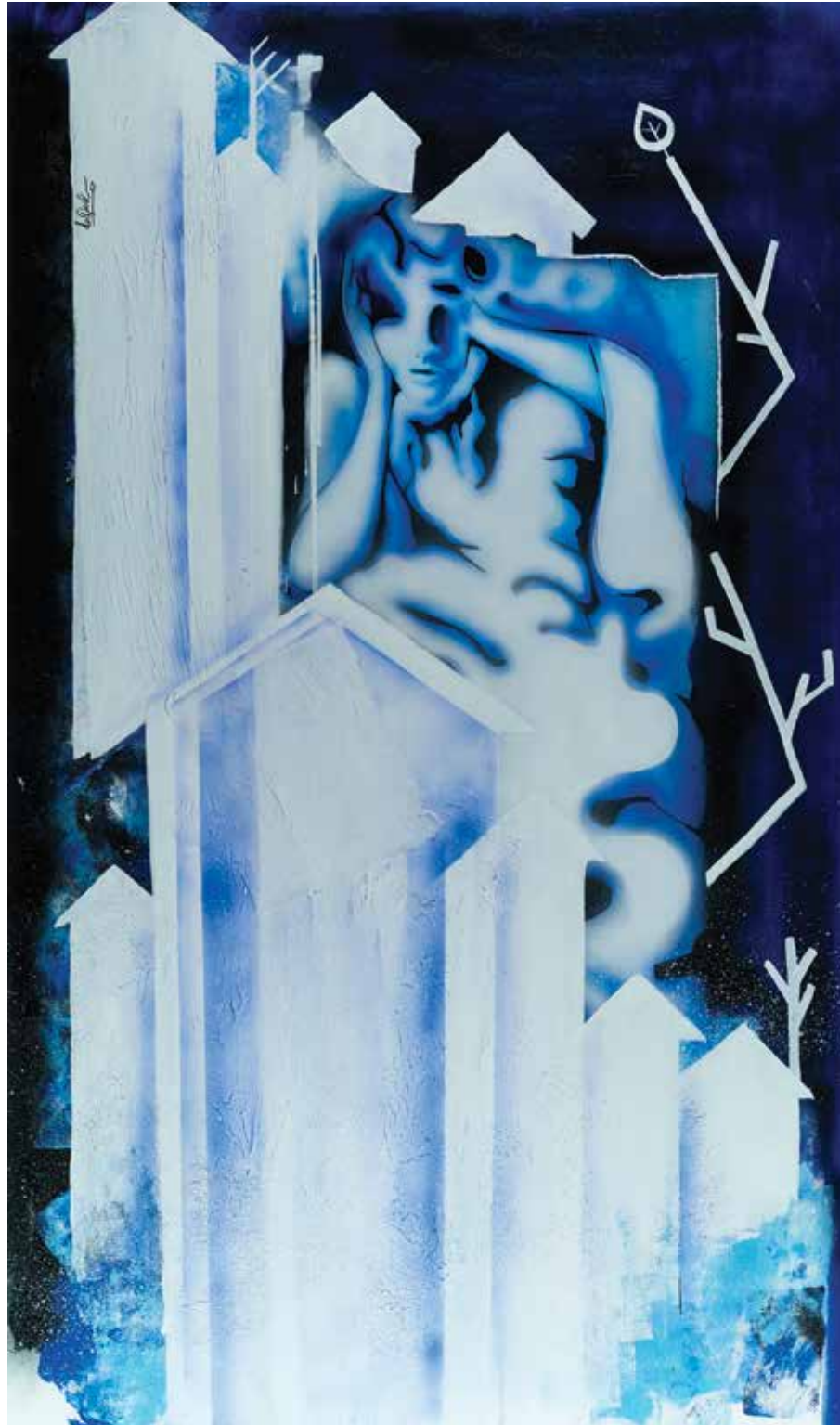
Cold Acrylic on canvas 36 x 60 inches