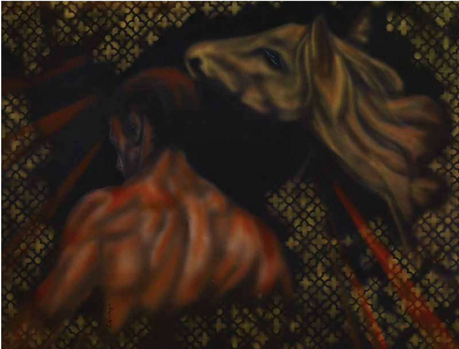
Companion Acrylic on canvas 60 x 48 inches

My dreams understand the whisper of my horse's ears