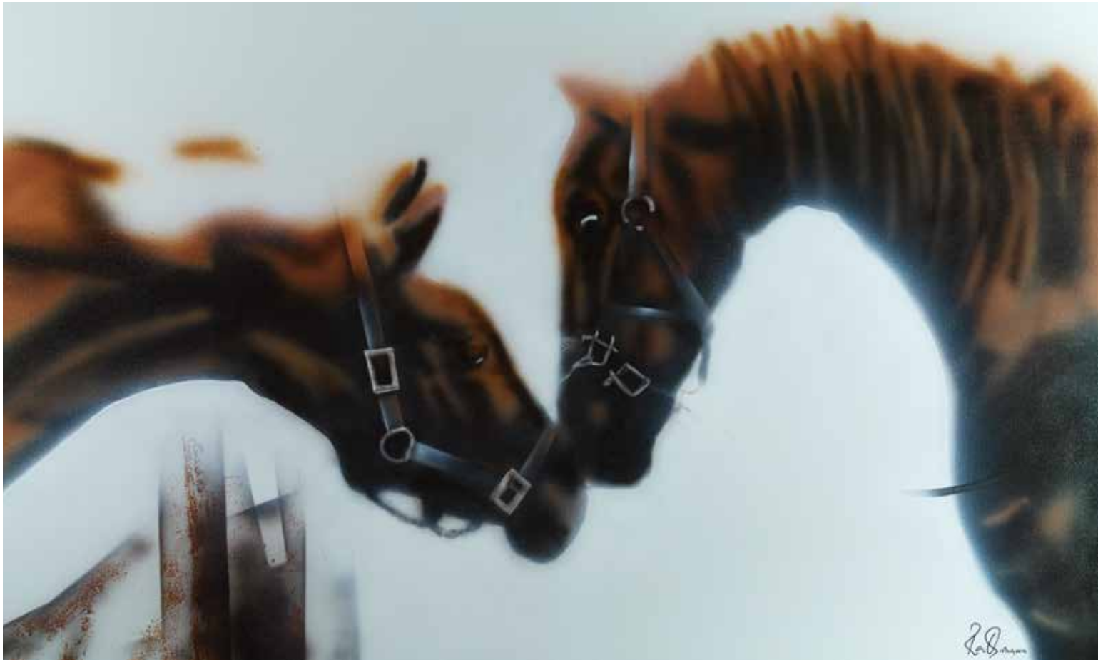
Valentine Acrylic on canvas 60 x 36 inches

True love sometimes needs only a moment of Eternity