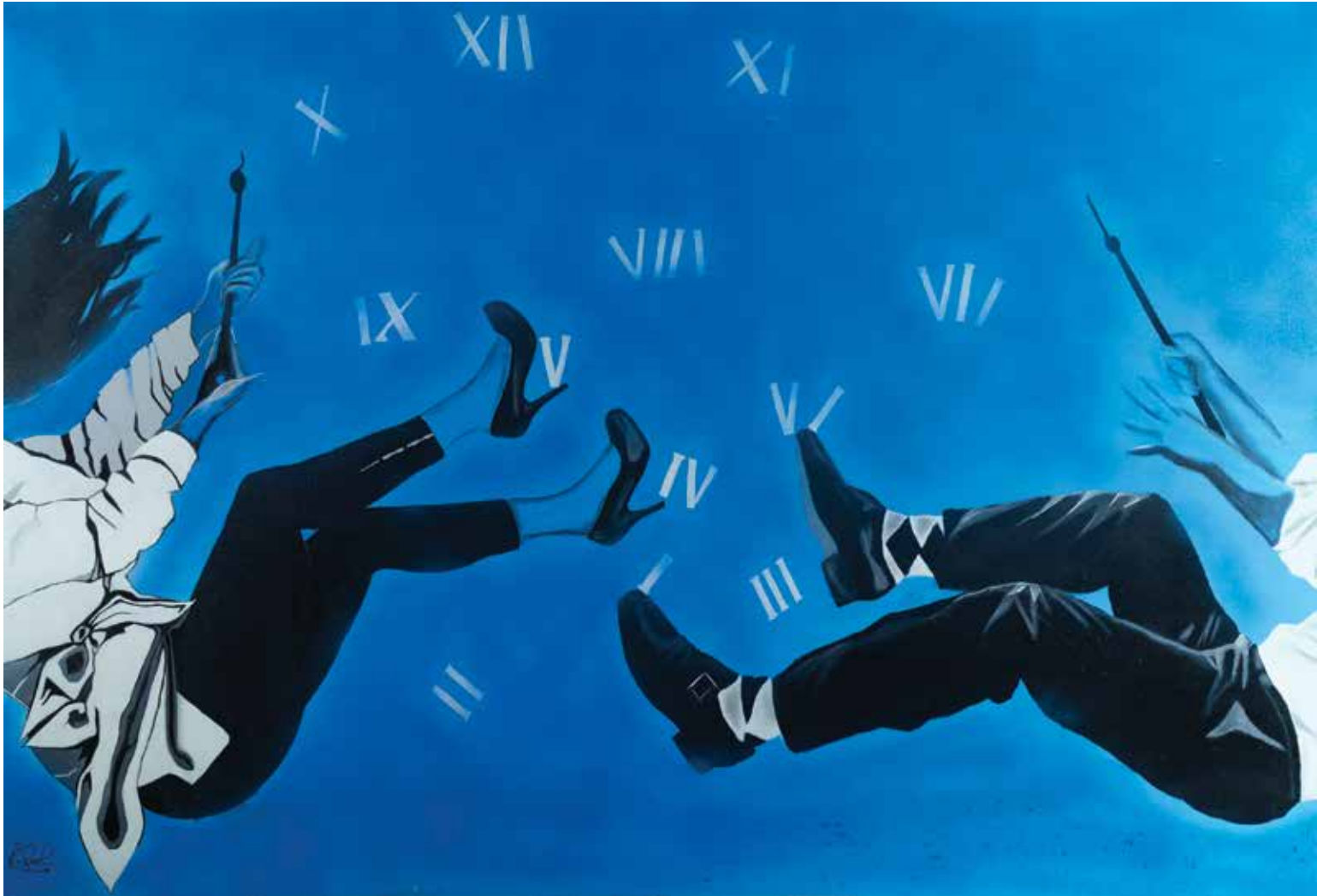
The August Dream

The glory of a flight is reserved for those who dare to jump