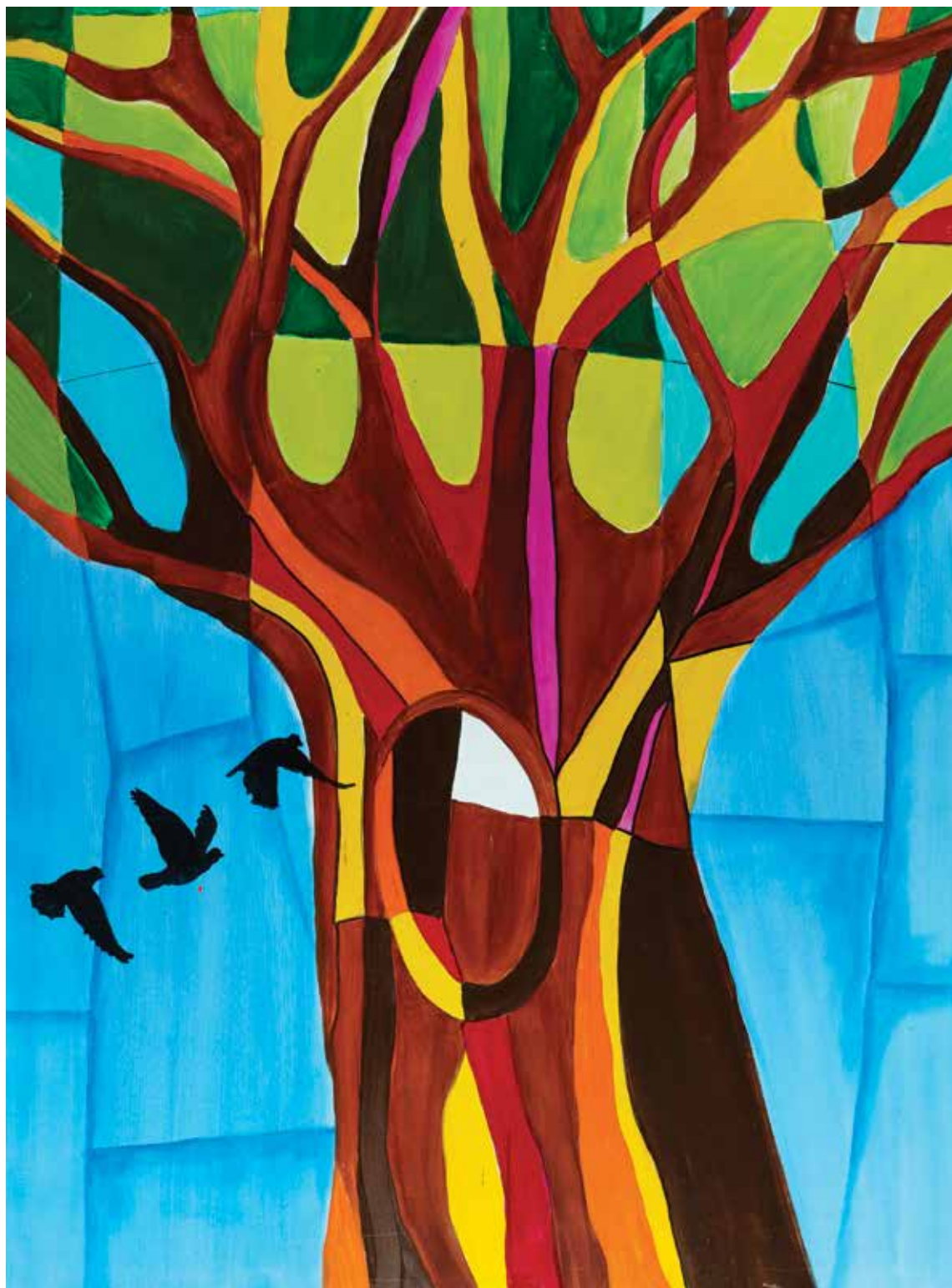
April Leaves Acrylic on canvas 36 x 48 inches

Let the beauty inside you bring vibrance to those color-blind