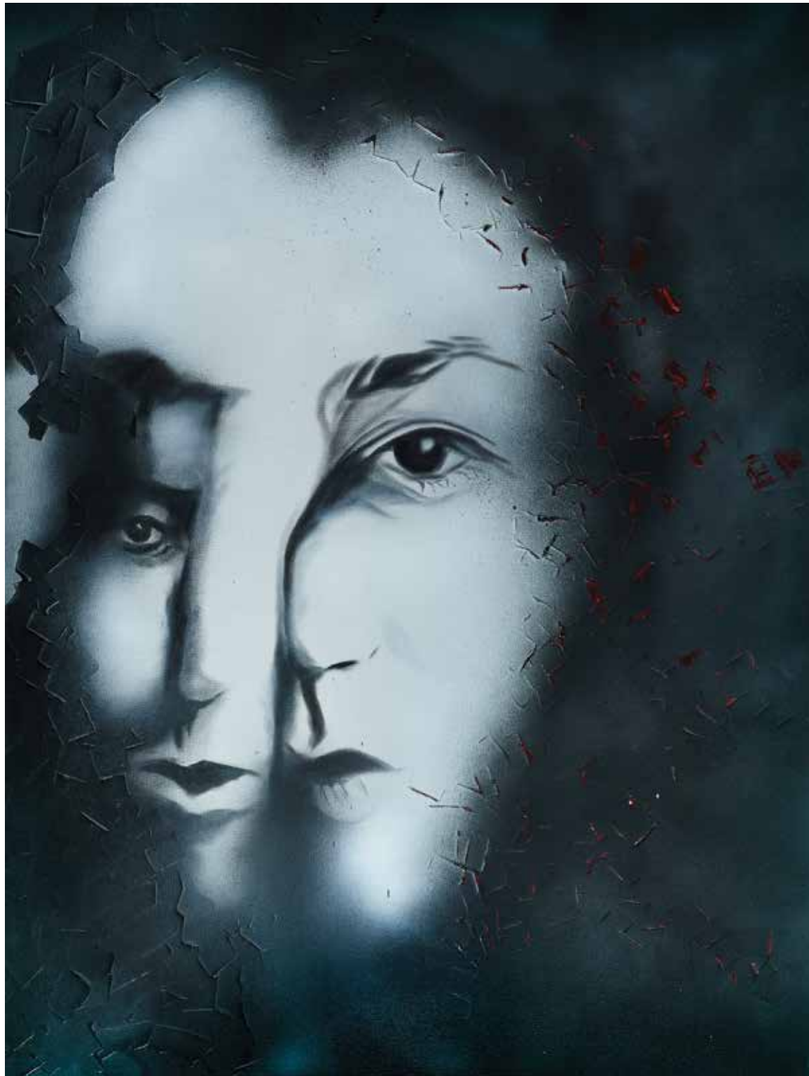
The Other Half Acrylic on canvas 36 x 48 inches

Paradox of humanity lies in its coexistence