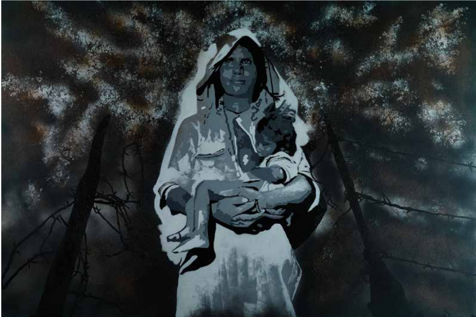
1947 - Freedom Acrylic on canvas 72 x 48 inches

Let my child make me a mother now, let me nurture and rejoice my true being now, let me walk without fear now