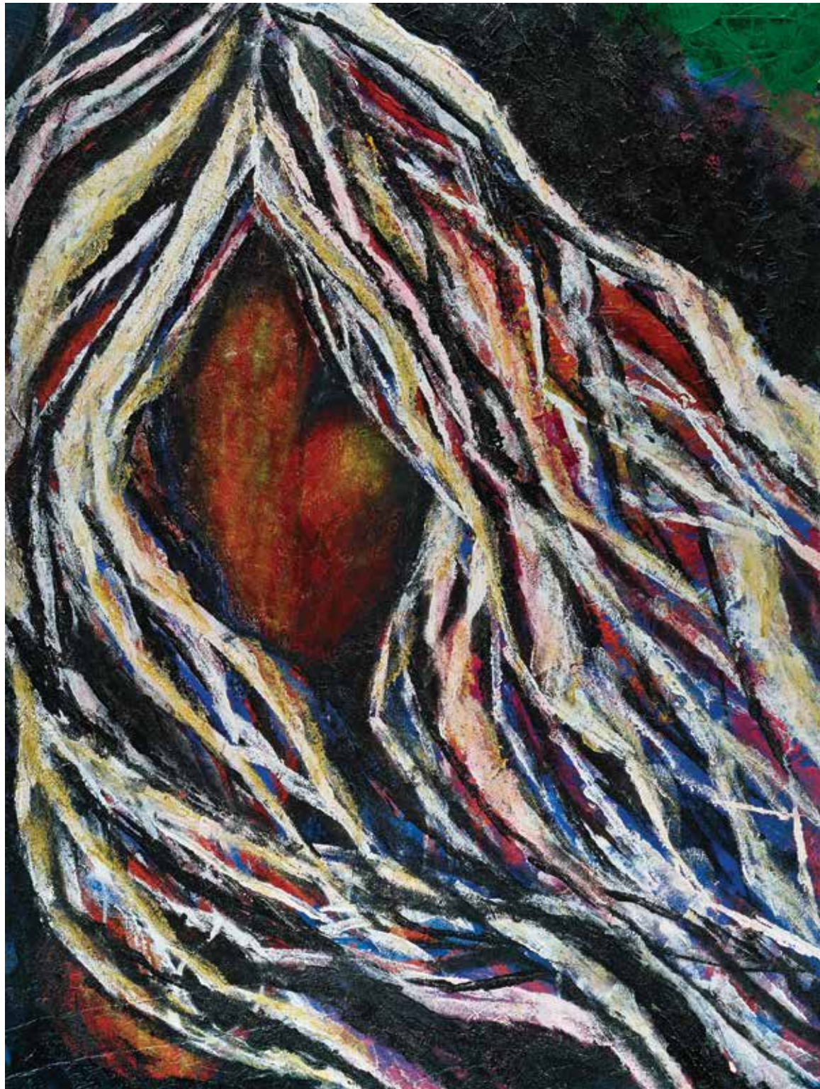
Ashwa Ganesh Acrylic on canvas 48 x 36 inches