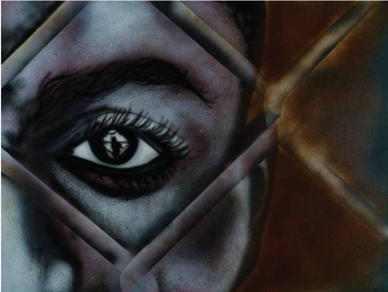
1947 - Hope Acrylic on canvas 48 x 36 inches

My truth is my hope, and that is enough for my soul