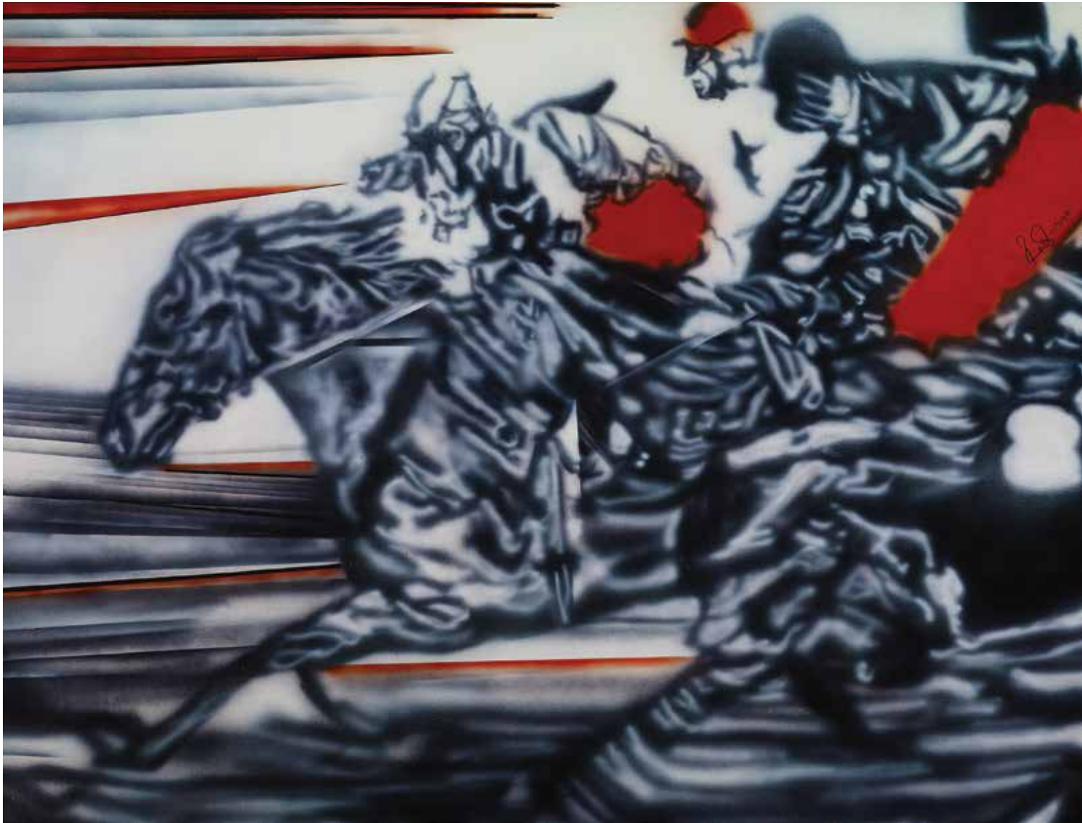
Adrenaline Acrylic on canvas 60 x 48 inches