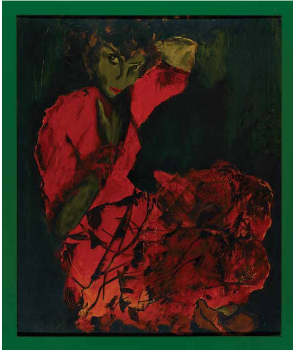
Sylvia - The Rag-picker Acrylic on canvas 31.2 x 36 inches

She holds within her piercing gaze mysteries of her undiminished spirit