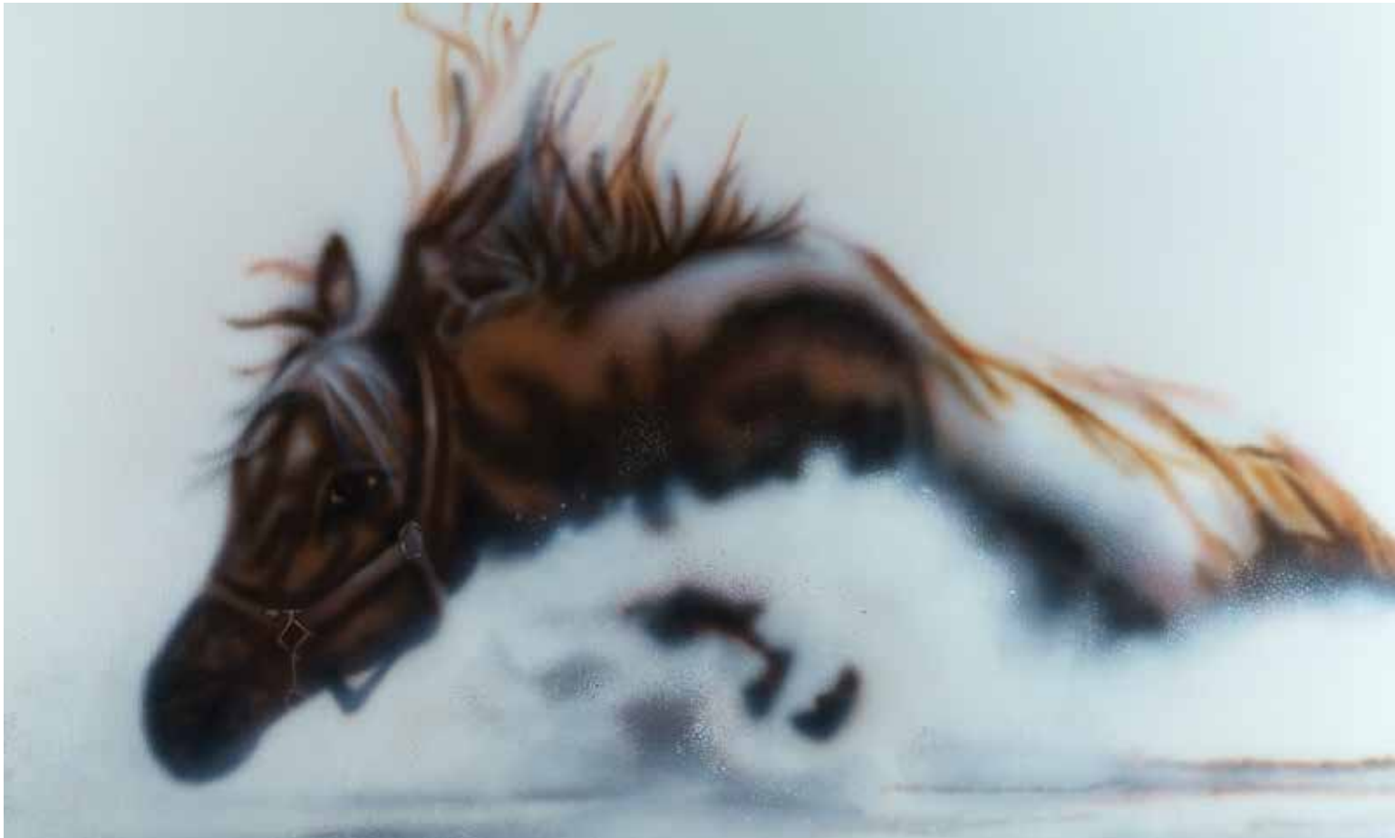
Water Shy Acrylic on canvas 60 x 36 inches

What do I do with the waves, when there is a whirlpool inside me