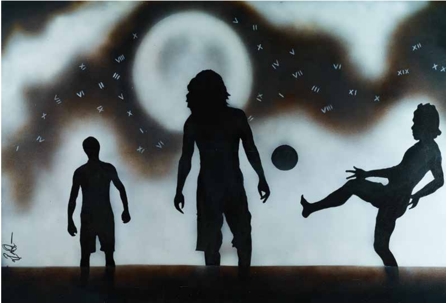
Constellation Acrylic on canvas 72 x 48 inches

Moments spent in creating memories hold time as witness in the sky