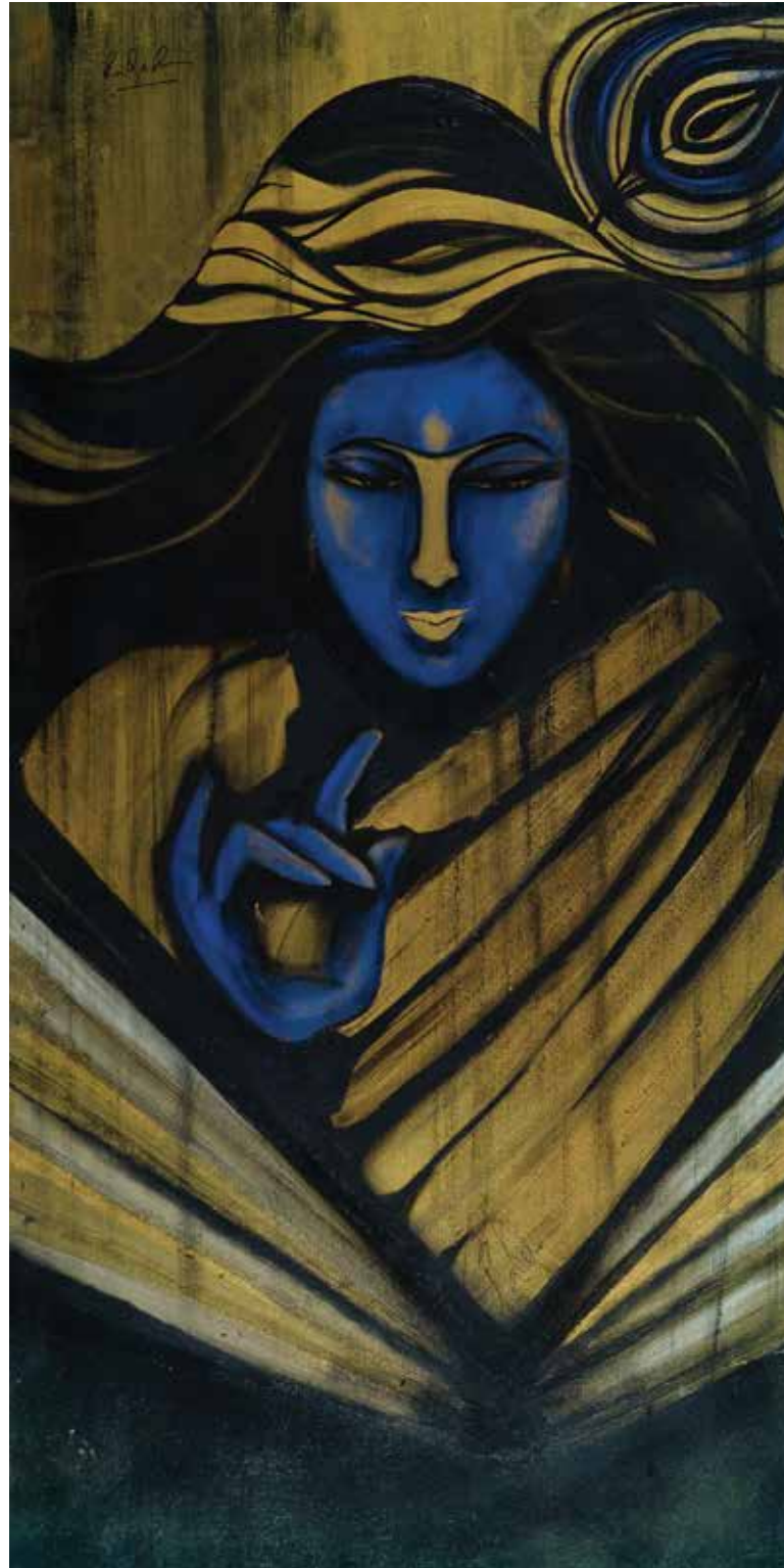
Shiv-Krishna Acrylic on canvas 28.8 x 51.6 inches